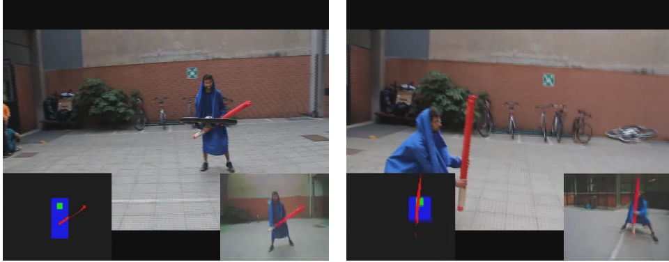
Figure 1: Facing the drone(left) and parrying (right) in outdoor environment. On the lower part, on the right the image from the drone camera, on the left the corresponding colour classification.