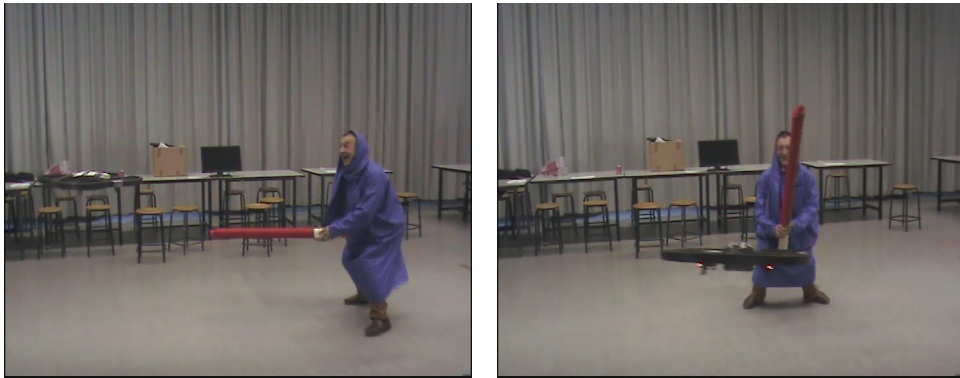
Figure 2: Facing the drone (left) and parrying (right) in indoor environment: different game conditions and player.

back. They did not know anything about the game, the developers, and the presenters. Their distribution by age and gender is reported in table 3.5.